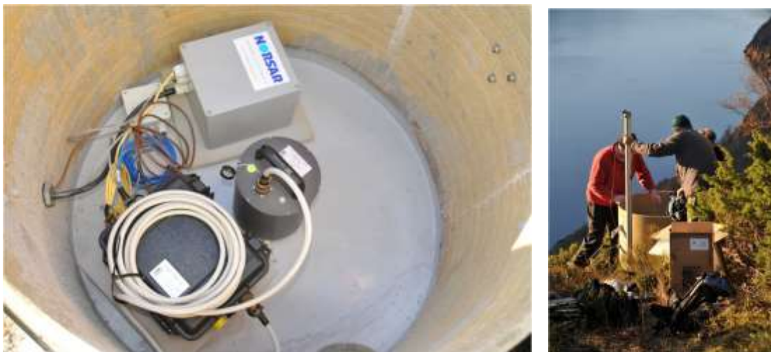
AKN seismometer pit with Guralp CMG-ESPC sensor, data acquisition system CMG-DM24S6DCM (black box) and communication/power box (grey box).