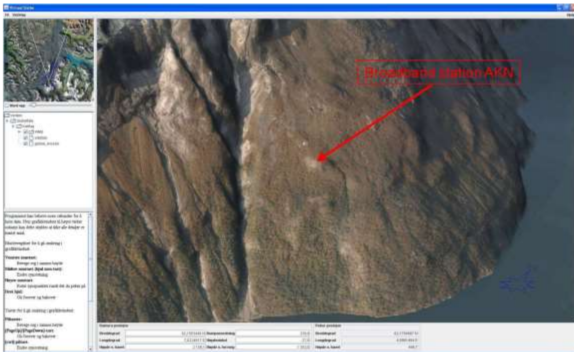
New broadband station AKN at Åknes, Møre og Romsdal (High-resolution aerial photo of the Åknes slope).

The 3-component broadband station AKN was installed in October 2009 at the unstable rock slope at Åknes, Møre og Romsdal. The station serves two purposes: i) the monitoring of local seismicity associated with the movement of the rock slope and ii) the monitoring of regional and global seismicity. The station was ordered and financed by Aknes/Tafjord Beredskap IKS, and will be maintained by NORSAR. The sensor is a Guralp ESPC seismometer with a bandwidth from 60 s to 100 Hz. Data are recorded continuously with a sampling rate of 200 Hz and transferred in real-time via radio link to NORSAR. The station is fully integrated into NORSAR's station network, the Norwegian National Seismic Network, and the Virtual European Broadband Seismograph Station Network (VEBSN, Orfeus).